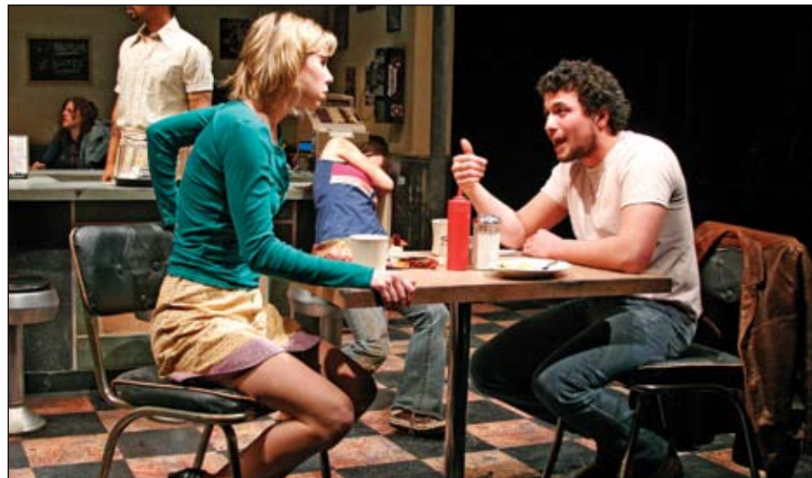
The Brandeis Theater Company will conjure the counterculture underground in groundbreaking play Feb. 8 to 18 in the Laurie.