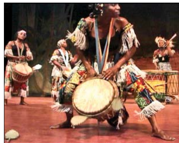
Amazones brings its art to Spingold March 3.